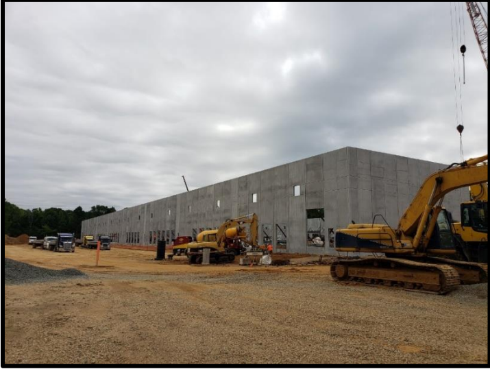
481 Blackhorse Lane: 243,000 SF