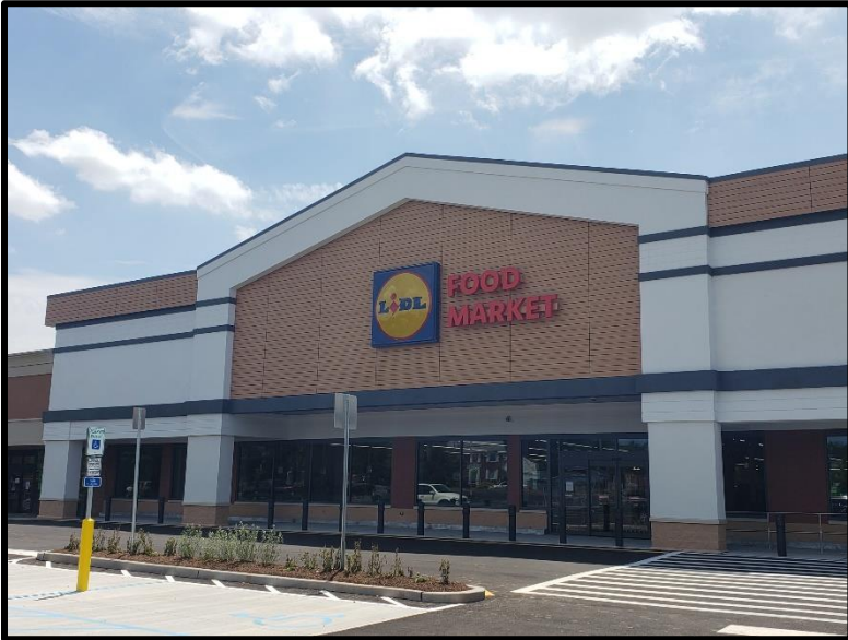
Lidl: 25,000 SF - Grand Opening July 29, 2020