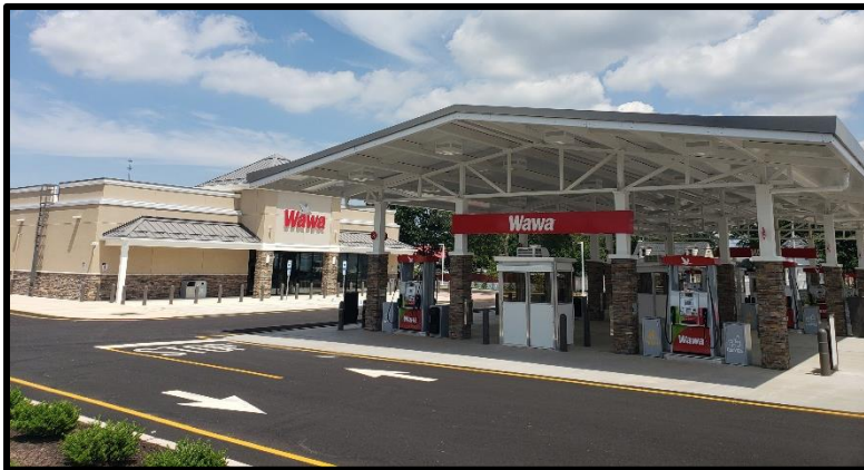
Wawa - Grand Opening Late August